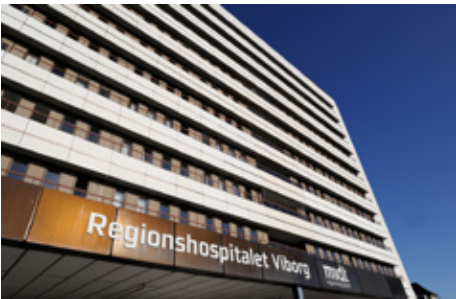
Surplus heat from hospitals can benefit local citizens.

Central Denmark Region clean up the site of a former dry cleaning company. This is to ensure clean drinking water supply to a area supplying a considerable number of citizens in the region.