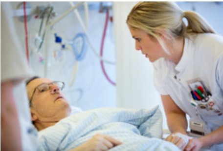
Music is believed to make a difference to patients' everyday life.