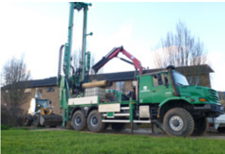
The region collects samples from the contaminated site.

Central Denmark Region participates in a pilot project together with the intensive care unit at Aarhus University Hospital, the Music Therapy education programme in Aalborg and The Royal Academy of Music. Small concerts are arranged in patient rooms considering patients' individual condition.